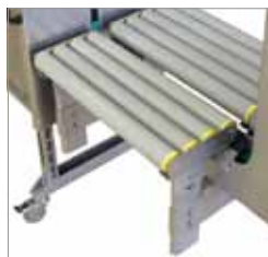
Various options Adaptable to different operating conditions and requirements

Machine, strap and after-sales service as a total package