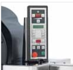
Simple adjustments, pivotable control panel

With driven belt conveyor for integration into fully automatic lines