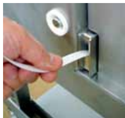
Quick coil change, automatic strap threading