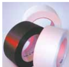
Strap for cost effective strapping Use of thin PP strap