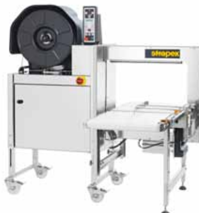
SMG 75i / SMG 75iS