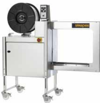
SMG 65i / SMG 65iS