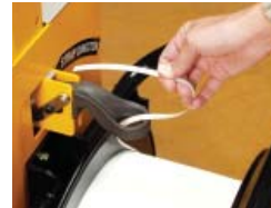
Simple coil change