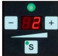
Strap tension easily adjustable with press button