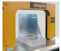
Bundle stops for precise positioning of loose packages