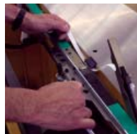
Maintenance without tools