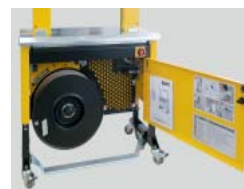
Robust, compact design