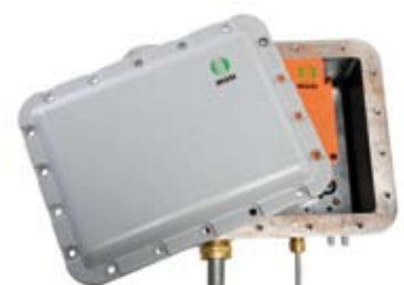
>>> TM 70 EX Receiver