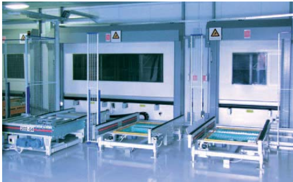
EFA-SRT®-CR in a material lock

The EFA-SRT®-CR is TÜV approved and clean room compliance has been certified up to ISO class 5 according to EN ISO 14644-1.